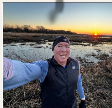
TARRANT CROSS CHILD Prairie Run Crew Lead